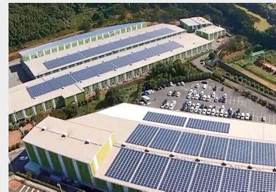
Kumamoto east plant